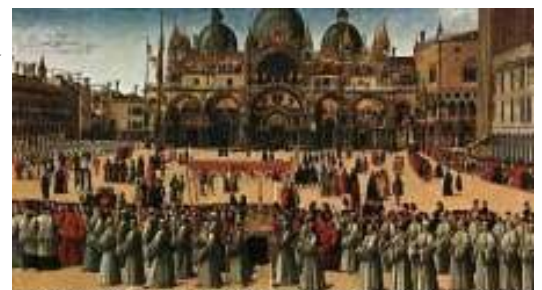
"Procession of the True Cross in Piazza San Marco," Gentile Bellini 1496 courtesy of Wikipedia Commons (image is in the public domain).

The primary function of the Gathering Space is this gathering as a community for worship.