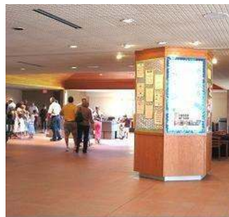
St. Ann Church, Long Grove, IA.