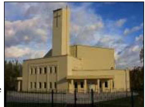
New Lutheran church in Petrozavodsk