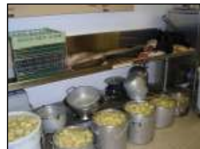
Lutefisk, Salmon & Meatball Dinner of 2010. Pails and pails of potatoes.